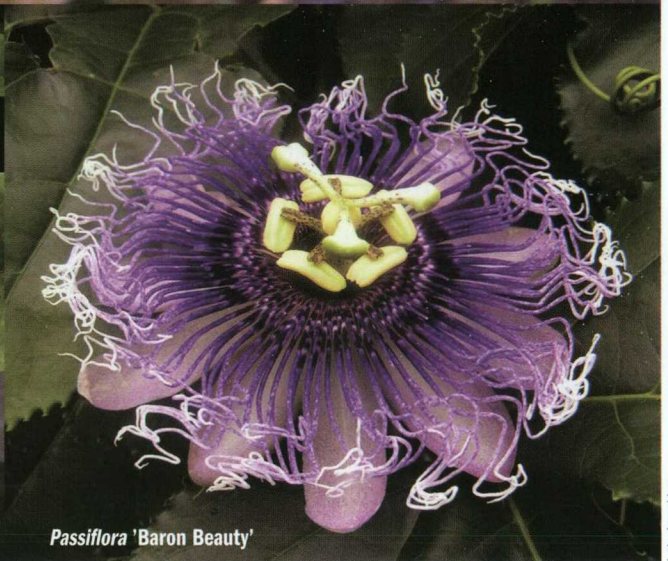
Passiflora 'Baron Beauty'