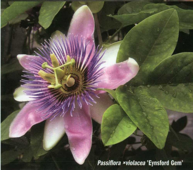
Passiflora × violacea 'Eynsford Gem'