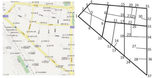
Fig. 2. The nodes of the road network

Fig. 2 presents the urban traffic transformation Figure G of several counties in Lanzhou, with 37 nodes. Their coordinates are shown in Table 1, and the distances between each node are listed in Matrix (26). Assume that each road in Figure G is bidirectional. The route information of the taxis is randomly generated based on the attributes of the taxis and passengers. The route information is shown in Table 2, the travel information of the passenger is P_i , the starting position is (3345, 2040), the departure time is 9:50 am, the number of carpoolers is one and the destination is (6675,6435). The multi-objective optimal model for choosing a carpooling point is established based on the coordinates of the nodes, the distance matrix of the nodes, the route information of the taxis, the positions where passengers get on and get off, carpooling waiting time and the similarity of routes. The weight of the decision-making matrix of the feasible routes is then confirmed using information entropy theory, and the comprehensive objectives of the feasible routes are determined as shown in Table 3.