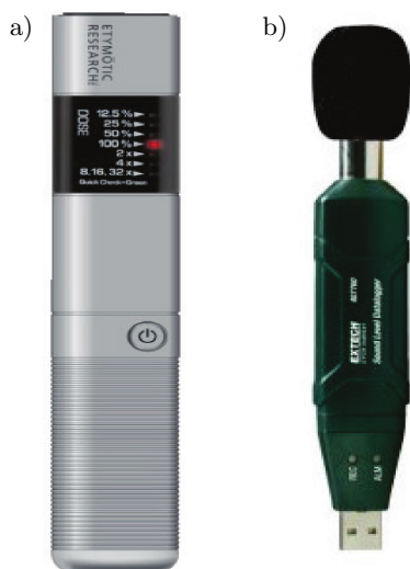
Fig. 1. a) ER-200D Personal Noise Dosimeter, b) Extech Sound Level Datalogger.

In order to assess workplace noise exposure and associated health effects (irreversible hearing damage, psychological and physiological adverse effects) in this specific profession, a full shift noise exposure of 40 teachers from 1 kindergarten, 2 primary and 2 high schools were measured in real condition using, ER-200D Personal Noise Dosimeter (Fig. 1a) and Extech Sound Level Datalogger (Fig. 1b).