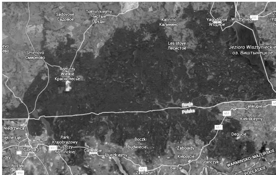
Fig. 4. Romincka Forest on both sides of Polish – Russian border