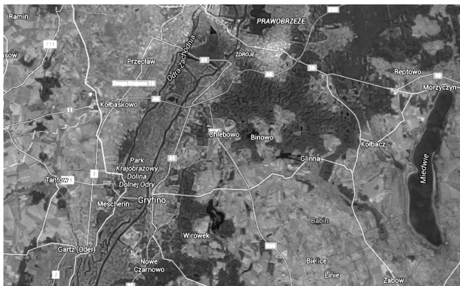
Fig. 5. Surroundings of the Landscape Park “Lower Oder Valley”

Planned, according to Polish – German initiative, the establishment of free ranging wisent population within the “Lower Oder River Valley” Landscape Park (about 6 thousand ha) has relatively small chances for development because of natural barriers created by watercourses (Oder River, Western Oder as