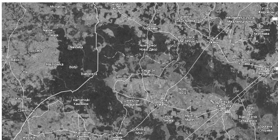
Fig. 1. Białowieża Forest and neighbouring forest complexes at Byelorussia