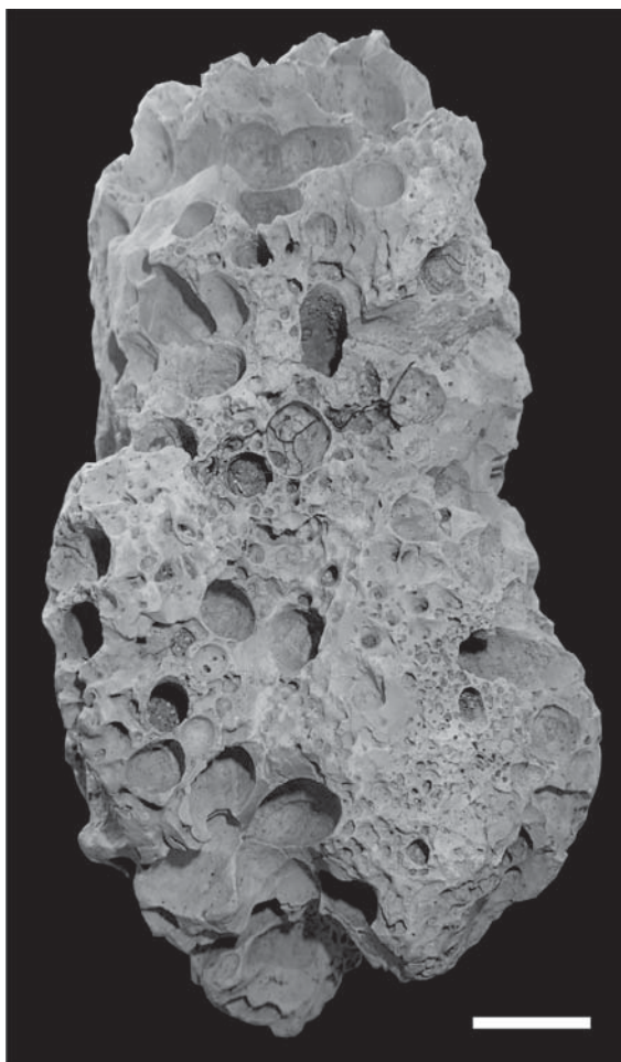
Text-fig. 1. Pebble from the littoral structures with many abraded borings of Gastrochaena spp. The shells of the newly described snail have been found in the sediment infilling the borings. Scale bar equals to 2 cm

REMARKS: I have found no report on the genus Chelidonura in the references on Miocene and Pliocene gastropods that I am aware of. The