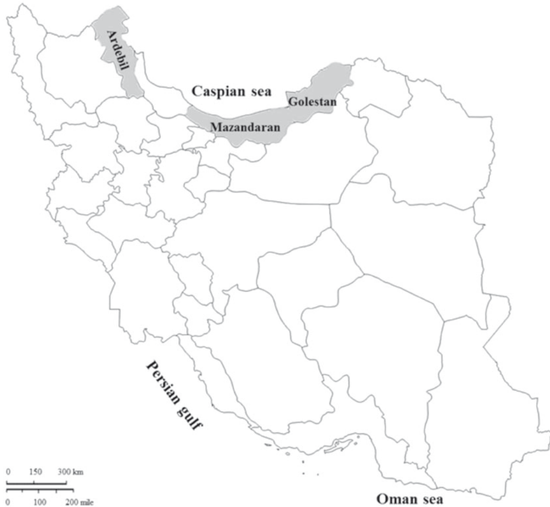
Fig. 1. Map of Iran showing sampling regions and data related to Fusarium isolated from different locations in pre-basic seeds wheat fields. Gray areas show where sampling was performed