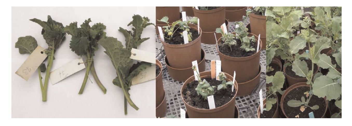
Fig. 3. Development of doubled haploids from Brassica napus haploid auxiliary shoots after treatment with in vivo colchicine

Excised axillary shoots of haploid plants (e.g., after vernalization) were immersed in 0.05% aqueous colchicine solution with the addition of 1.5% DMSO for 22 h. Shoots were then rinsed several times in tap water and placed in soil for rooting and further growth. The shoots were rooted in the conditions of a growth chamber and then, the newly developed plants were moved to a greenhouse. Such developed plants did not require re-vernalization. From meristem angular leaves, new shoots grew up and developed into proper flowering shoots (Fig. 3). Shoots from untreated haploid plants were assumed to be haploid, while colchicine-treated angular shoots with at least one fertile flower were assumed to be diploid.