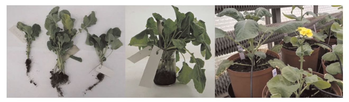
Fig. 2. Development of doubled haploids from Brassica napus haploid plantlets after treatment with in vivo colchicine.

until the embryos developed sufficiently to be visible to the naked eye (Cegielska-Taras et al., 2002). To assess the effect of spontaneous doubling of the number of chromosomes, isolated microspores of the winter oilseed rape cultivar Monolit were cultured without the addition of colchicine.