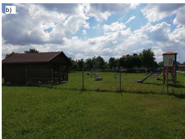
Photo 1. Investments in Szyleny: a) water and sewage project, b) playground and recreational shelter