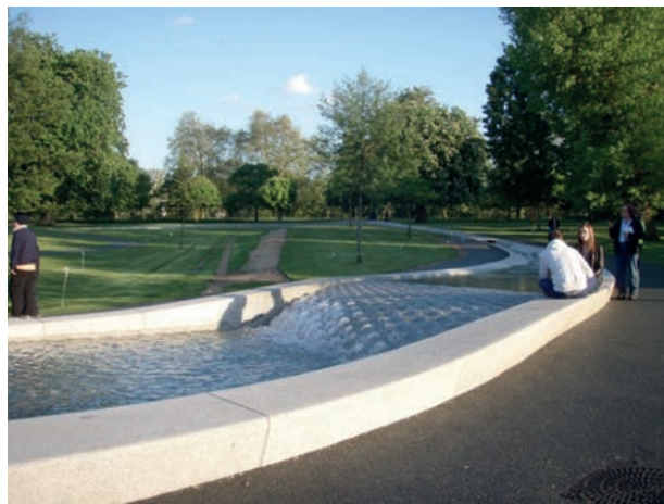
Il. 3 Memoriał Diany, Księżnej Walii, Londyn, UK, 2003–2004.