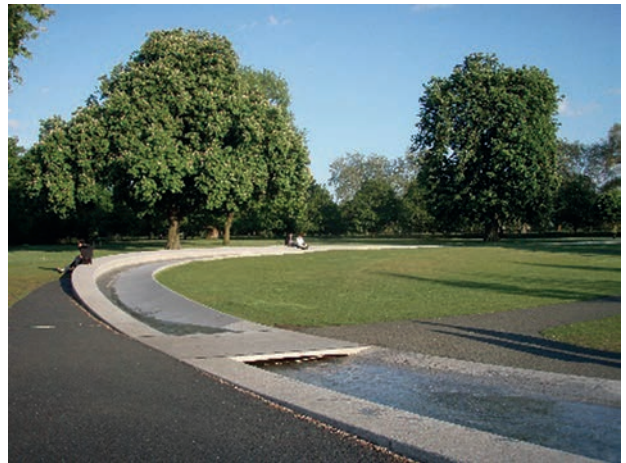
Il. 4. Badania dynamiki i statyki wody na przykładzie Memoriału Diany, Księżnej Walii, Londyn, UK, 2003–2004.

Il. 4. Study of water's dynamic and static states on the example of The Diana, Princess of Wales Memorial Fountain, London, UK, 2003–2004.