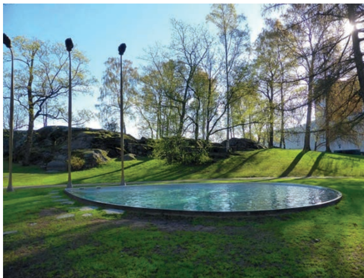
Il. 1. Memoriał fińskiego prezydenta Urho Kekkonen, Helsinki, Finlandia, 2000.