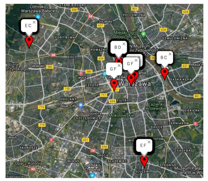
Fig. 4. Physical meetings of TIMS users in Warsaw, Poland

Figure 4 presents the users' meeting locations in Warsaw. The accuracy of the API geolocation service enables us to identify user meeting locations in several city districts. More accurate data can be collected from telecom operators. Therefore, the level of accuracy may be easily increased to specific street names.