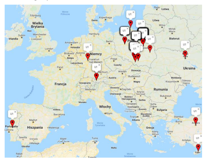
Fig. 2. Top places visited by User A

All locations were predicted based on IP data. The accuracy of that data allows us to visualize the location with a specific city district. 128 most frequently visited locations were chosen for User A. The Locations were visualized using Google Maps and they may be seen in Fig. 2. Each pin depicts one place that was visited. The map does not show the frequency of visits, but it is possible to derive that information from the database and to generate an appropriate report. No summary of all user locations has been presented in a graphic form, as it is similar to the map presenting the most frequently visited locations. It consists of much larger data set, e.g. for User A it has 1,011 entries identified during the period of the experiment.