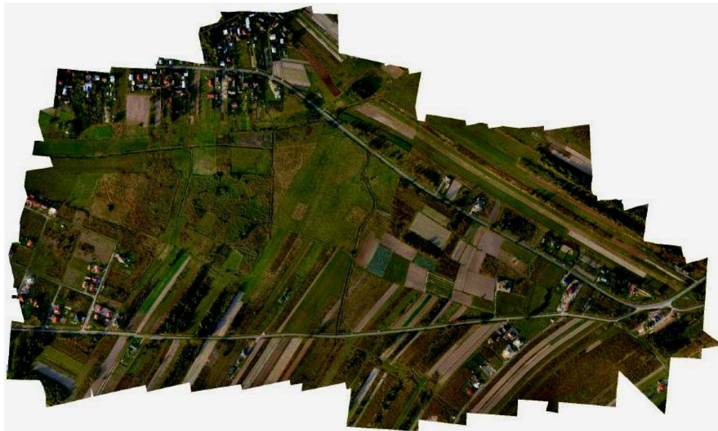
Fig. 2. Unmanned aerial vehicle measurement – a view with no scribe lines of the registered plots boundaries' bends

The scribe lines of the registered plots boundaries' bends were measured by the direct method in GPS-RTK technology with the Topcon GR-3 receiver. The next stage was to indicate on the wooden pegs the photopoints – black and white four-point chessboard (Photo 1), of 100×100 mm, and for 100 points located in a compact group of signals 148×210 mm. The use of signals with different dimensions was aimed at examining the readability characters for different pixel size and choosing the best optimal one.