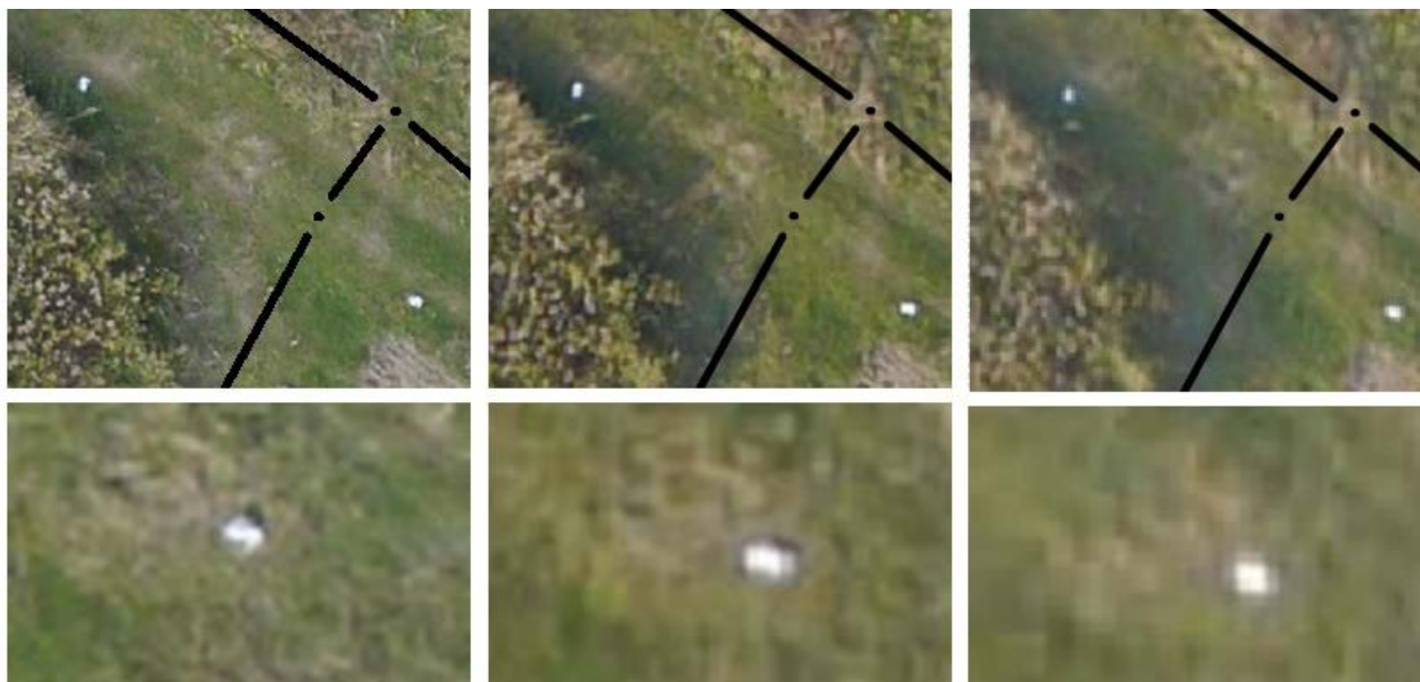
Fig. 3. Legibility of pixelated points of interest: 3 cm, 5 cm and 7 cm