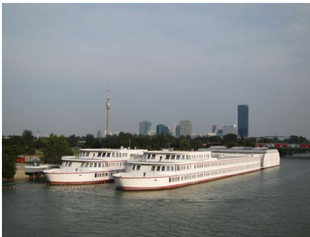
Photo 2. Bertha von Suttner floating school – general view

differences between them. Firstly, there is a 65 year gap between the time each of them was opened for use; secondly, they float on two different rivers – the Seine and the Danube; thirdly – the purpose of each of them is different – one was a shelter, the other one is a school. What connects them and makes them worth attention, however, is that they provide services to local community and they are quite valuable pieces of floating architecture which are parts of the European architectural heritage.