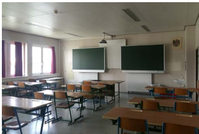
Photo 8. Bertha von Suttner Gymnasium: classroom interior

An unusual location of the school breaks down the daily school routine and mitigates the learning and teaching hardships for students and teachers. The glittering waves of the beautiful blue Danube, broad prospects, slowly passing huge transportation barges and fast speeding motorboats seen from the windows – all this makes studying more attractive and encourages to follow the daily routine. Teachers seek to be assigned a classroom with a view to the river (Photo 8). Classrooms with windows with a view to the island are much less liked. Working in so unusual and original – in terms of a big city – environment is a positive stimulant which facilitates community integration.