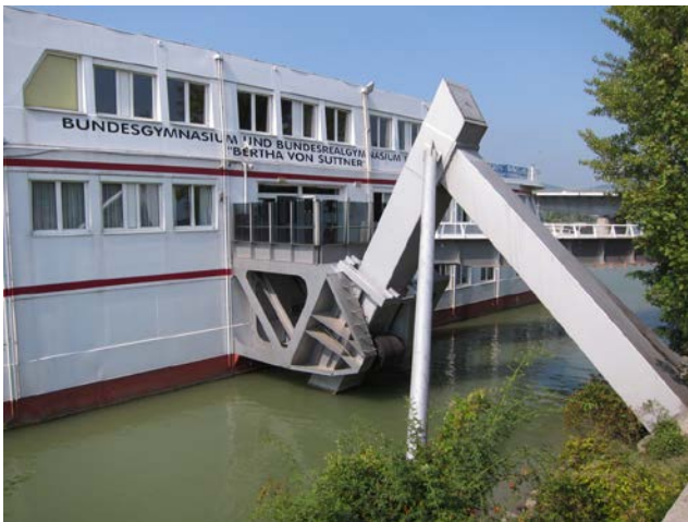
Photo 6. Bertha von Suttner Gymnasium: docking pylon near the main entrance