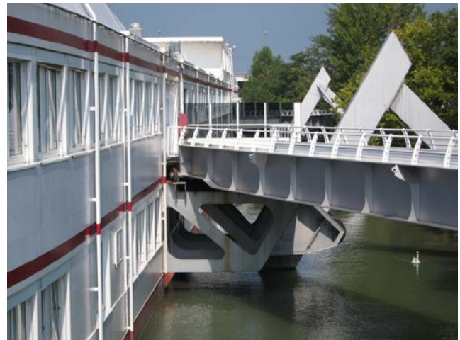
Photo 5. Bertha von Suttner Gymnasium: broadside adjacent to the river bank, gangway to the auxiliary entrance