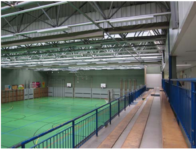
Photo 4. Bertha von Suttner Gymnasium: “Gym Island” – the school gym, a view from the auditorium