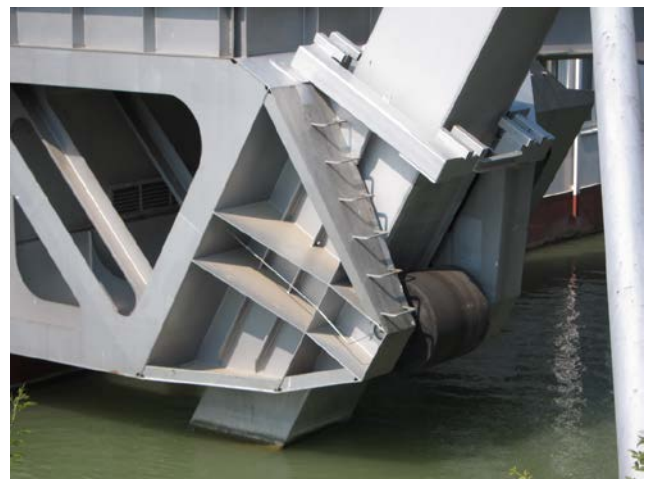
Photo 7. Bertha von Suttner Gymnasium: a shiftable mooring element

the ground level of Donauinsel. When the dam was constructed in 1997 and the river swelled, the mounting of gangways to the bank was elevated and the barges were accessible to people moving on wheelchairs (Photo 5). Inside the barges all the levels are accessible also by lifts installed in each of the three units.