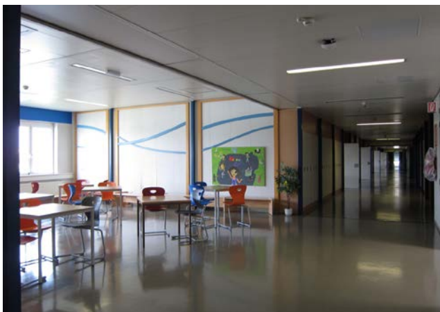
Photo 3. Bertha von Suttner Gymnasium: corridor – doors to classrooms and student relaxation area

a dead weight of approximately 6500 t. Each of the two teaching units has got two decks all along and an additional third deck in the superstructure in the bow part. Internal layout of both teaching units is the same, being also similar to that of Asile Flottant – two rows of pillars form central corridors (Photo 3). Each unit is almost 140 m long. The school was designed for approx. 1000 students and 100 teachers. The main entrance and lobby are located on the second deck, in the front part of the unit on the bank side. School administration offices such as Secretariat, Headmaster’s Office, other administration offices and a concert hall as well as other rooms, such as a nurse room, are adjacent to the lobby.