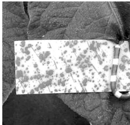
Fig. 1. The method of placing water sensitive paper on leaves

Table 2 shows mean values of the spray quality indices, i.e. the number of droplets ( n_k ) and the spray coverage ( s_k ) in relation to the operating pressure ( p ), whereas Fig. 2 presents the dependence of the spray coverage ( s_k ) on operational pressure ( p ). The best spray quality was recorded when the RSMM 110-02 nozzle was employed. However, it was characterised by a reduced level of the leaf surface coverage at the increasing working pressures. The worst results, within the range of