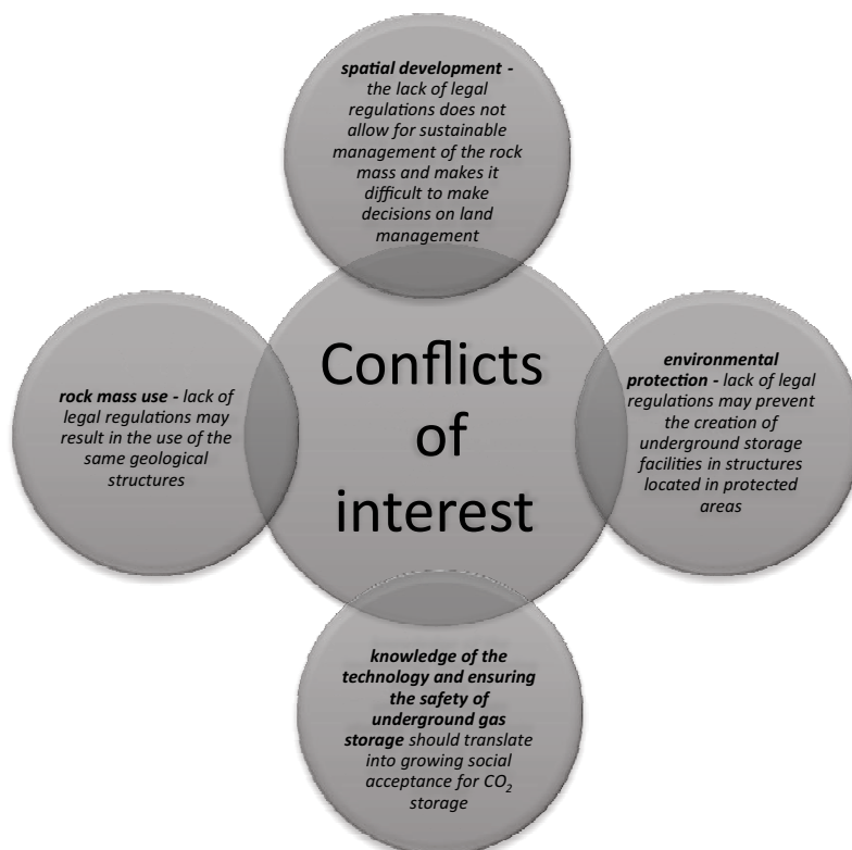
Fig. 3. Conflicts of interest related to underground storage of natural gas, carbon dioxide, and hydrogen

Rys. 3. Konflikty interesów związane z podziemnym magazynowaniem gazu ziemnego, składowaniem dwutlenku węgla i magazynowaniem wodoru