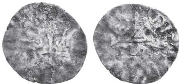
Fig. 1. Imitative coin with the inscription •VIDV beneath the gable from the Hradec Králové hoard 1931 (National Museum, Prague, inv. no. H5-305899)

The foreign component of the find included Hungarian denarii of Stephen I (997–1038) and Saxon denarii of the Otto-Adelheid type, and also another denarius on which the obverse depicts an equal-armed cross with the letters O-D-D-O in the angles, and on the reverse, a church with the letters •VIDV beneath the gable. 3 The inscriptions on both sides of the coin, which is very worn, are illegible. It weighs 0.788 g and has a diameter which ranges between 17.2 and 18.6 mm (fig. 1). It contains 92 % silver, and is therefore not a forgery but an imitation, resembling the Saxon denarii of the Otto-Adelheid type on the obverse, and on the reverse the Bavarian or Bohemian denarii with cross and church minted in the second half of the 10 th and early 11 th centuries. 4