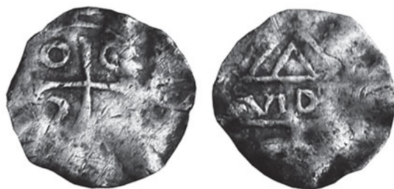
Fig. 2. Imitative coin with the inscription •VIDV beneath the gable, found in 2016 in Prague-Klánovice (private collection)

Numismatists started showing an interest in the imitative coinage with the inscription •VIDV in the 1990s. The first to list, discuss and date the type was Peter