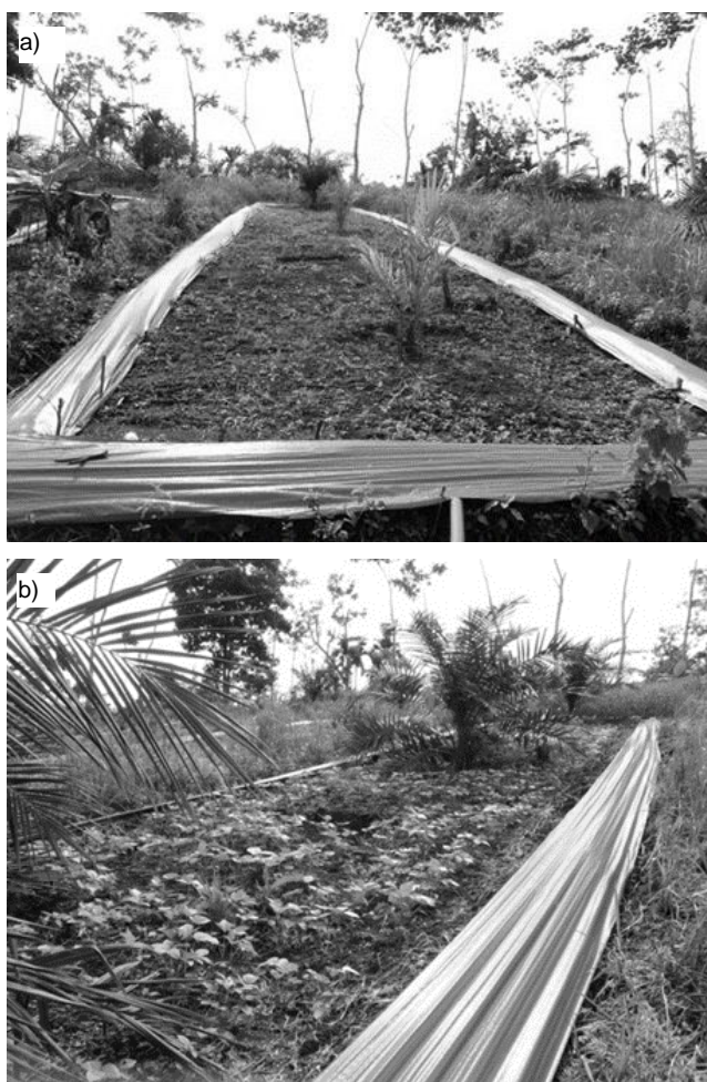
Photo 2. Soil conservation technologies applied in the experiment of land capability class IV: a) sediment trap, b) sediment trap + cover crop + manure

Soybeans are planted between rows of oil palm trees as cover crops. They are planted throughout the year, planting 3 times a year by burying. During the period of growth, soybeans are treated from pests and diseases and harvesting is