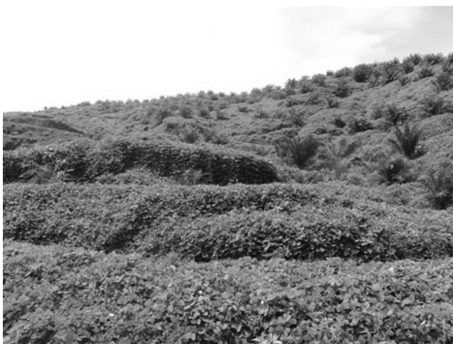
Photo 5. Bench terrace + cover crop in plot of land capability class VI

Soil conservation treatment on land capability class VI significantly reduced erosion and runoff more than the control treatment ( p < 0.05 ) – Table 3. The bench terrace + cover crop + manure treatment significantly reduced surface runoff by 63.59%, compared to the control treatment, followed by bench terrace + cover crop (56.16%) and bench terrace (45.26%), respectively (Photo 4). The bench terrace + cover crop + manure (P3) reduced soil erosion more than other treatments, 64.73% compared to other erosion controls. Soil nutrient leaching, runoff, and erosion were greatly influenced by the conservation treatment applied (Tab. 3 and Photo 5), in which the percentage of C-organic and total nitrogen were significantly affected by the P3 treatment. However, phosphate and potassium leaching was not affected by the treatment. In this group, bench terrace + cover crop + manure (P3) was the most effective in preventing nutrient leaching.