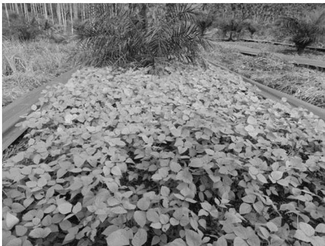
Photo 4. Individual terrace + cover crop + manure in plot of land capability class III

Explanations: LSD = least significant difference; different letter notations in the same column show significant differences on the 0.05 LSD test. Source: own study.