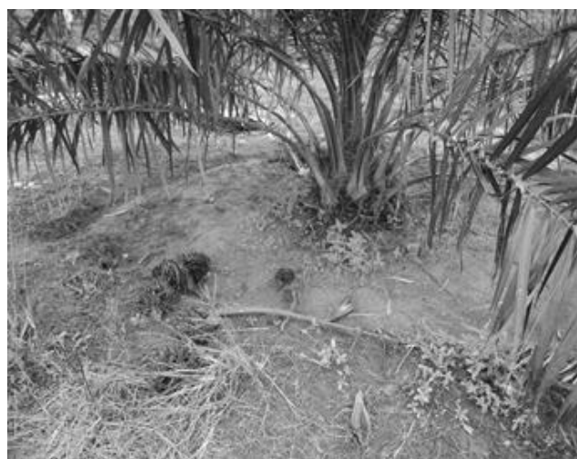
Photo 1. Individual terrace in plot of land capability class III

Individual terraces have a length and width 1.5 × 1.5 m and a depth of 20 cm (Photo 1, Fig. 1). Sediment traps are long and wide soil trenches, measuring 1.5 m long, 1 m wide, and 0.5 m depth, made in the midst of planting rows perpendicular to slope direction (Photos 2a, b). The community designed the bench terraces, perpendicular to slope direction, with 3 m width and 1.5–2 m height (Photo 3). Bench terraces were constructed when preparing land for oil palm planting. Leguminous cover crops were grown with spacing of 20 cm × 30 cm.