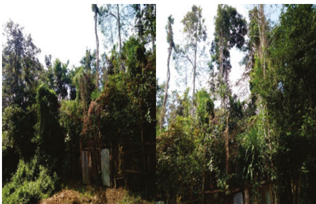
Photo 1. Sections of the communal barn system at Amangwu in Ohafia LGA, Abia State

The difference between the two conservation centres is that at the MTPA puts emphasis on Elaeis guineensis , while the Amangwu barns do not make such a distinction. All species are strictly out of bounds. Nobody is ever permitted to touch any of the trees. Hence, there are many species such as Ficus exasperata (sand paper tree), Iringia gabonensis (bush mango), Newbouldia laevis (West African border tree), Pterocarpus mildbraedii (Oha/ora trees) etc.