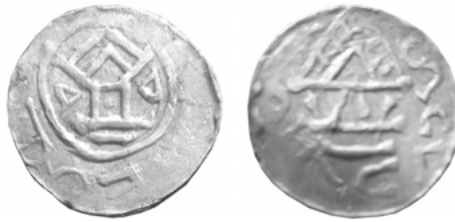
Fig. 8. Otto-Adelaide/Cach 74 denier. Gorzów Wielkopolski – vicinity. Scale 1.5:1

The die was made by an unskilled engraver – the letters are unevenly scattered, and the inner circle is made with little precision using many simple cuts. There are a number of missed burin strokes and scratches on the die's surface. Like the previous specimens, this coin is characterised by its high weight.