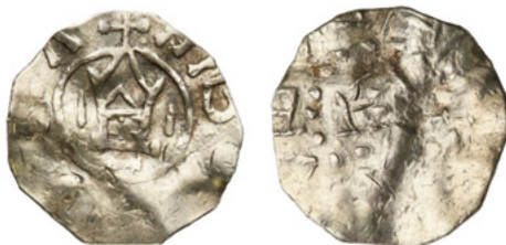
Fig. 2. Bolesław I the Brave's denarius. 19 mm; 1.46 g. Scale 1.5:1 (Antykwariat Numizmatyczny M. Niemczyk 29.4429)

Rv.: in the center, a schematic chapel with two points in the middle, a ring with loosely scattered points, a blundered inscription in the edge HI/////VE//