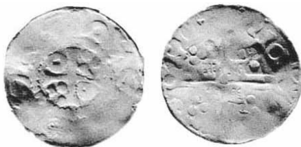
Fig. 10. Cach 74/ Long Cross denier. Łupawa hoard. Scale 1.5:1 (SCBI 36:1122)

Another connection is represented by a coin of unknown origin, offered for sale by the Warszawskie Centrum Numizmatyczne. This time, the coin imitates the reverses of the Anglo-Saxon Æthelred II Helmet type from the years 1003–1009. A characteristic feature of the new Helmet type die is the use of square punches to strike dots on the corners of the chequered field.