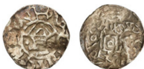
Fig. 1. Pomeranian imitation of the Lupow type. 1.15 mm; 0.55 g. Scale 1.5:1 (Antykwariat Numizmatyczny M. Niemczyk 29.4429)

At the 29 th auction of Antykwariat Numizmatyczny Michał Niemczyk, two coins were offered for sale under the number 4429, described as “Fancy imitations of Otto and Adelaide”. 4 This description is true in essence, but can be significantly expanded. The first of the coins is a Pomeranian imitation in the Lupow type, dated to the second half of the 11 th century (Fig. 1). 5