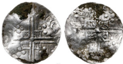
Fig. 11. Long Cross / Long Cross denier. Scale 1.5:1

9. Rv.: Long Cross with arms ended with three semicircles. Under the cross, there is a square box with chequering, on the corners three dots were placed. The lower fragments of the inscription are poorly visible in the ring