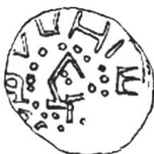
Fig. 3. Uniface denarius of Bolesław I the Brave from the hoard from Kujawy I. Scale 1.5:1 (Wittyg 1921; FMP III.215:502)

Assessment of the material collected and published in the Frühmittelalterliche Münzfunde aus Polen (FMP) series shows that the coin struck with a new type of die has hitherto occurred only once – in the hoard from Kujawy I ( tpq 1027), published in 1921 by Wiktor Wittyg (Fig. 3). This 0.5 g coin, struck on one side, was originally attributed by Wittyg to Sweden, 9 but was described as an imitation of the Otto and Adelaide type by the authors of the latest inventories. 10 Though schematic, the figure published in W. Wittyg's publication leaves no doubt that the coins from the Kuyavian hoard and M. Niemczyk auction were both struck from the same reverse die. It is worth emphasizing here that hoard from Kujawy I also contained regular coins of Bolesław I the Brave and Mieszko II, as well as imitations with the inscription .VIDV and +JIVA. 11