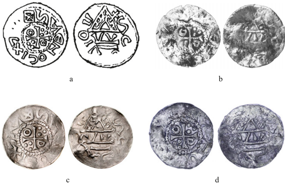
Fig. 7. Cach 74 type denarii. Scale ca. 1.5:1: a – Cach 74; b – Wiślica; c – PDA 17, no. 23; d – Historical Museum in Moscow (fot. J. Magiera)

Another coin expanding the .VIDV die-chain is a denarius, which may have been found “near” the Warta River in the vicinity of Gorzów Wielkopolski. Unfortunately, the coin is only known from poor-quality photographs. 26 However, there is no doubt that in addition to the Bavarian-type reverse described above, a strongly stylized chapel inspired by the Otto and Adelaide type was struck on the obverse. It is worth noting that this chapel imitates slightly younger variants, where the roof is disproportionately large in relation to the structure itself, while the internal beaming comes out of the roof structure. This coin is also characterized by its high weight.