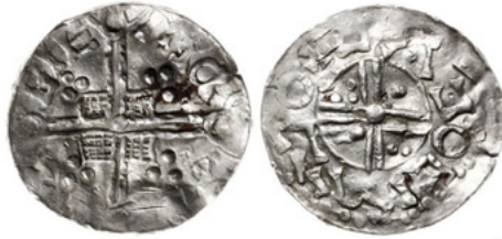
Fig. 12. Long Cross / Short Cross denier. Scale 1.5:1 (photo WCN)

10. Rv.: Short Cross with a point in the center, in the linear circle. In the two fields between the arms, one dot, in the next field, two dots, in the last one three dots. Along the edge, the blundered inscription + UΛ∩OΕΙΩ∩∩∩