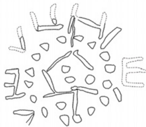
Fig. 4. Reconstruction of the newly discovered die of Bolesław I the Brave's coins (drawn by M. Bogucki)

To sum up, the newly discovered die used in Bolesław I the Brave's coinage is a very loose interpretation of a motif popular in early medieval coinage, most notably in German coinage, featuring a chapel and a circumferential legend. Owing to the very low technical skills of the die engraver, it is not possible to more closely identify the design prototype. It was probably based on the most popular denarii of Otto and Adelaide type, but it could equally have been Bavarian, Franconian or even a cross denarius.