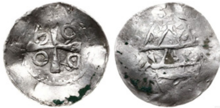
Fig. 9. Otto-Adelaide/Cach 74 denier. Scale 1.5:1 (photo WCN)

7. Rv.: equal armed cross with wedge-expanding arms, between them the letters ODOD, dashed inner circle. The letters of the inscription are barely visible along the edge