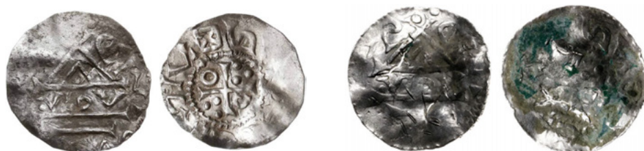
Fig. 6.a–b .VIDV/Cach 74 type denarii. Scale 1.5:1

4. Rv.: in the center, a cross with extended ends of arms, between its arms O / three points / D / three points, beaded inner circle; along the edge the blundered inscription SS/HOCIXAIVI X