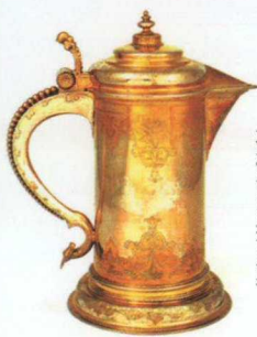
National Museum in Gdańsk

Wine jug used during the celebration of the Lord's Supper in the Evangelical Church of the Augsburg Confession. This particular item originates from the workshop of Michael Dietrich (1709)