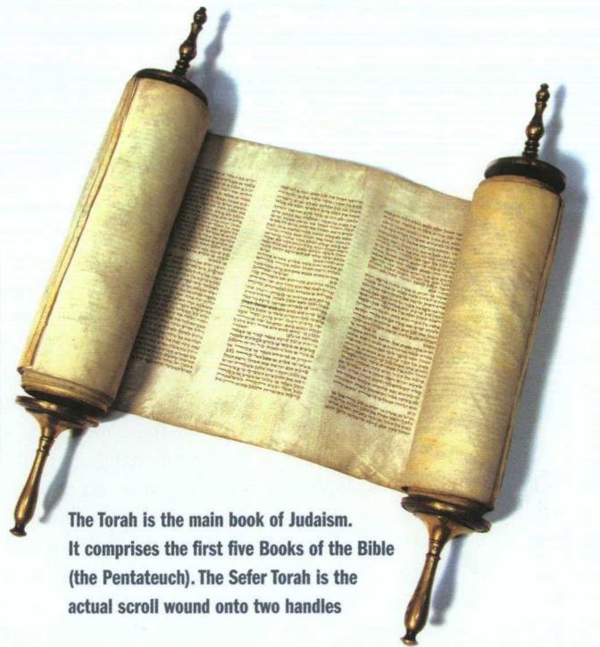
The Torah is the main book of Judaism. It comprises the first five Books of the Bible (the Pentateuch). The Sefer Torah is the actual scroll wound onto two handles

Emanuel Ringelblum Jewish Historical Institute