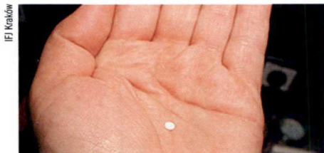
A small TLD pellet - a miniature detector measuring cosmic radiation doses

many practical applications and the design of detectors tailored to special needs, including the ability to manufacture them in large numbers. This is why we were invited to participate in the Matroshka project.