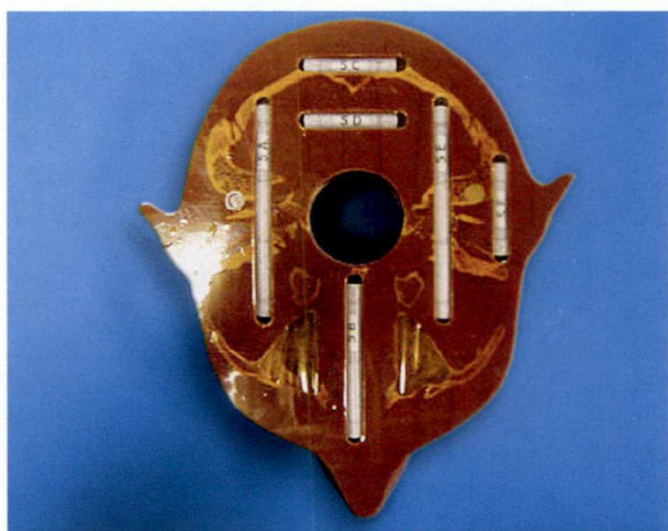
One of the slices with tubes containing TLDs. The whole phantom is filled with over 5000 TLD detectors in a 2.5 cm grid

In summary, radiation encountered in space is a mixture of all possible types of radiation, with an extremely wide energy spectrum, so it is very different from what we can experience on Earth. This is what makes space radiation dosimetry so difficult and so interesting.