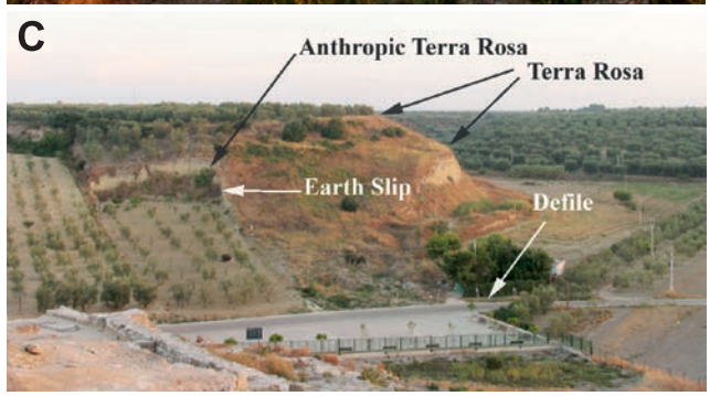
Fig. 2. A, Low terrace with olive clusters; B, Escarpment surface, greatly disturbed, with a mix of carbonate and terra rosa remnants; C, View to the south across the defile and parking lot of the Museo Cannense with high bluffs beyond showing (to right) remnants of deep terra rosa paleosol with irregular lower boundary. To the left, part of the land surface looks to have undergone land slippage, the soil (viz paleosol) having been eroded leaving carbonate plus organics (Ah material) behind, a typical anthropic profile.

to break the weakest link in the Roman line, their right flank of heavy horse against the Aufidus River. The very fact that the Romans preferred the floodplain and low terrace, as the site of engagement must have come from their confidence in superior numbers bringing a positive outcome, and a belief their cavalry could hold its own against the Carthaginians (Healy, 1994). Hannibal must have been overjoyed at the prospect that his cavalry would have the low-lying terraces on which to operate, prime topography for them. But what of the higher terraces, and in particular the prominent defile to the southeast of the battle site (Figs 2C and 3), a valley obscured by a bluff to the north, and situated so that it