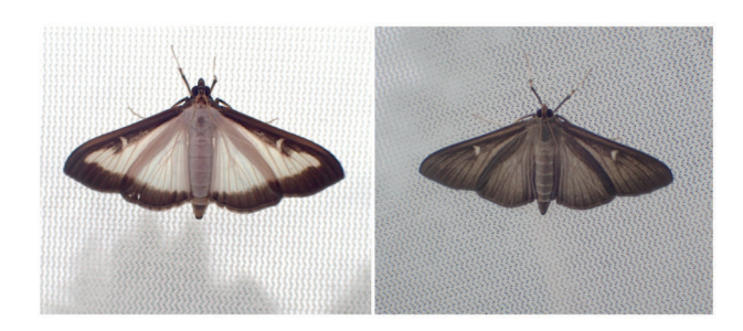
Fig. 1. Two distinct color morphs of Cydalima perspectalis : a light (left) and characteristic melanistic form (right)

parent eggs on the underside of boxwood leaves, deep within the bush, which complicates monitoring efforts (Bereś et al. 2021). The eggs are round, approximately 1 mm in diameter, initially, light yellow and covered with a transparent secretion that helps them adhere to the leaves. As the eggs develop, they enter the "black head" stage, where the black head capsules of the developing larvae become visible through the eggshells (Bereś 2019) (Fig. 2). After a few days, the larvae hatch. The larval stage consists of 6-7 instars (Capelli et al. 2018). Newly hatched larvae are yellow about 1.5-2 mm long, with black, shiny heads equipped with chewing mouth parts (Fig. 2). Initially, light green with brown lines, the larvae darken as they grow, developing characteristic black stripes with white dots, light bristles along their sides, and two rows of black warts on their dorsal side (Leuthardt and Baur 2013; Matošević 2013; Dobrzański et al.; 2018 Bereś 2019) (Fig. 2). The pupa reaches a length of 1.5 to 2 cm and is concealed within a cocoon of white silk, located between boxwood leaves and twigs. Initially green with dark stripes, the pupa gradually turns brown as it develops, with a segmented pattern resembling the brown coloration found on the moth's wings (Fig. 2) (Maruyama et al. 1993; Leuthardt and Baur 2013; Matošević 2013).