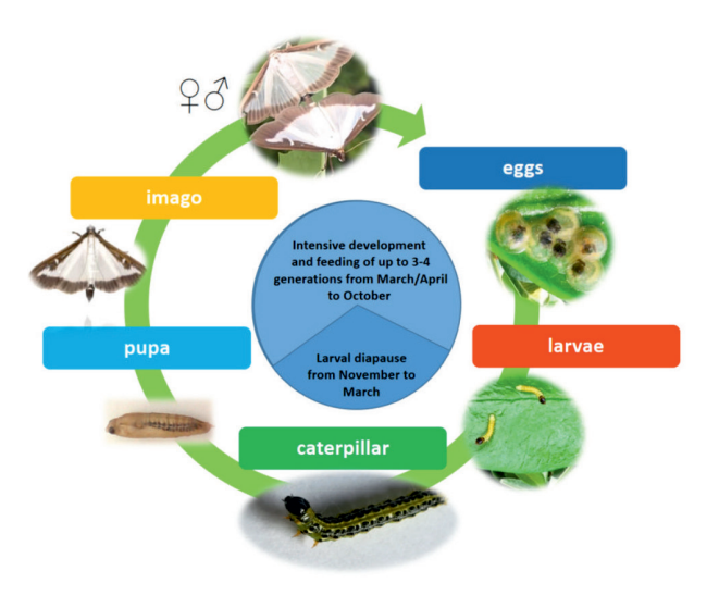
Fig. 3. The scheme of life cycle of Cydalima perspectalis

this period by 2 days. Adult moths have an average lifespan of about 2 weeks (Korycinska and Eyre 2011; Leuthardt and Baur 2013). A simplified diagram of the pest's development cycle is presented in Fig. 3. The life cycle of the box tree moth is temperature-dependent,