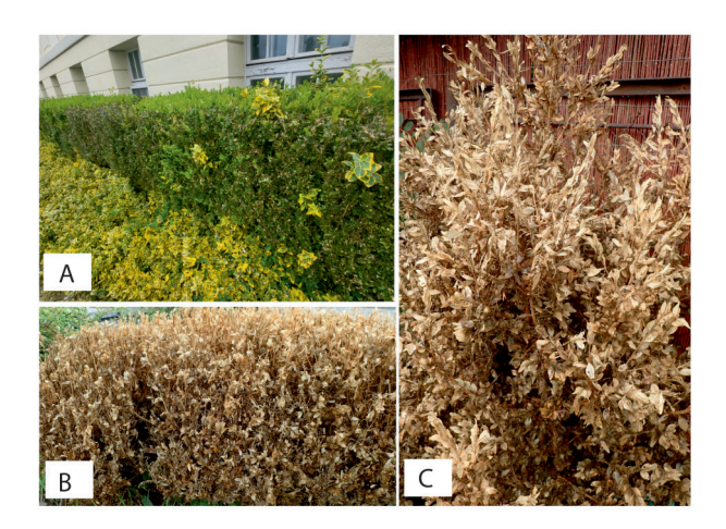
Fig. 4 . Symptoms of boxwood damage caused by Cydalima perspectalis .

Initially, young larvae cause "windowing" damage by consuming tissue from the surface of the leaves. As they mature, larvae consume entire leaf blades, leaving only the veins and edges, which often curl characteristically (Fig. 4). Scientific observations have shown that in the absence of leaves, the late larval stages can also feed on shoots, stripping the bark (phloem), disrupting nutrient and water transport, and significantly weakening the plant (Lemic et al. 2023).