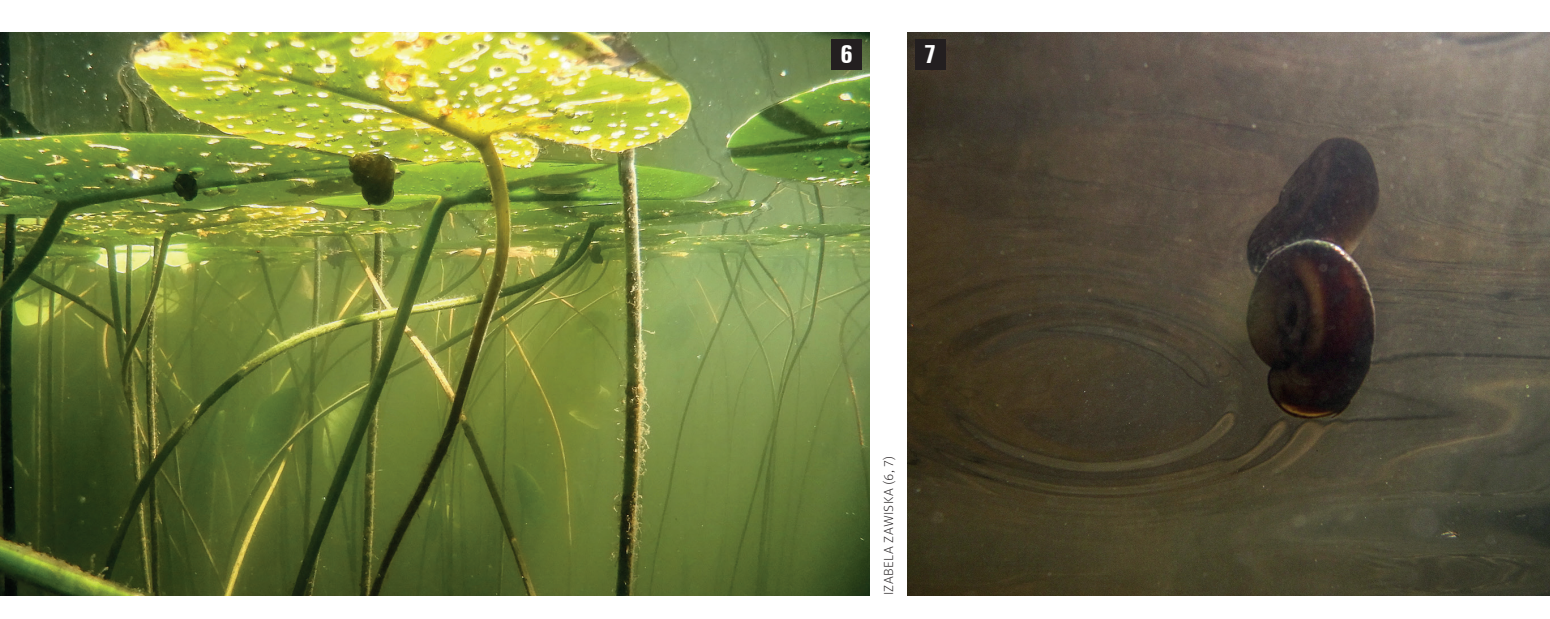
Photo 6 The underwater labyrinth of life Photo 7 Underwater perspective