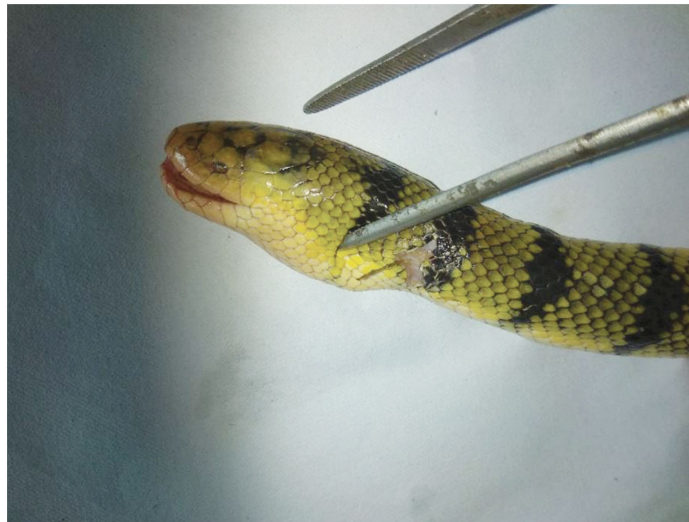
Figure 3. Hydrophis spiralis head with entanglement removed, with a 1.4 cm wooden spike pinned in the wound.

on these characteristics, the individual was identified as Hydrophis spiralis , using the identification keys provided by Karthikeyan and Balasubramanian (2007) and Rezaie-Atagholipour et al. (2016).