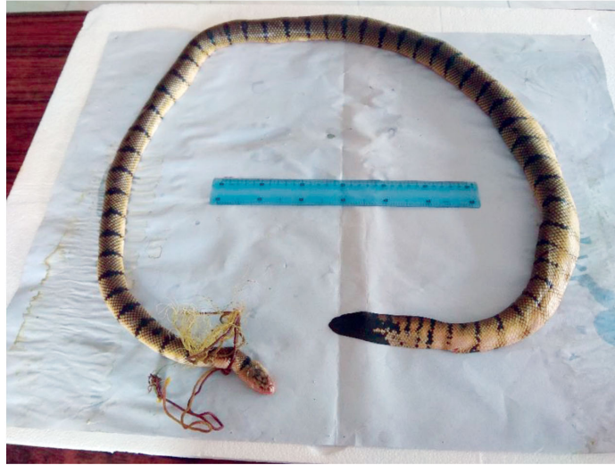
Figure 2. The entire Hydrophis spiralis has entanglement, and the length of the snout-vent is 152 cm.