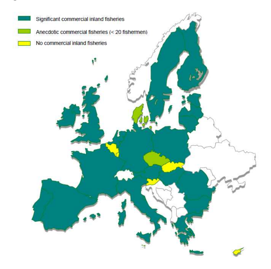
Fig. 3. Commercial inland fisheries within the EU