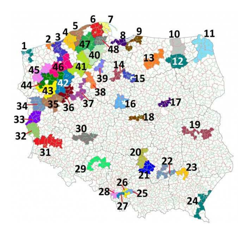
Fig. 2. The Map of FLAGs in Poland (February 2012)