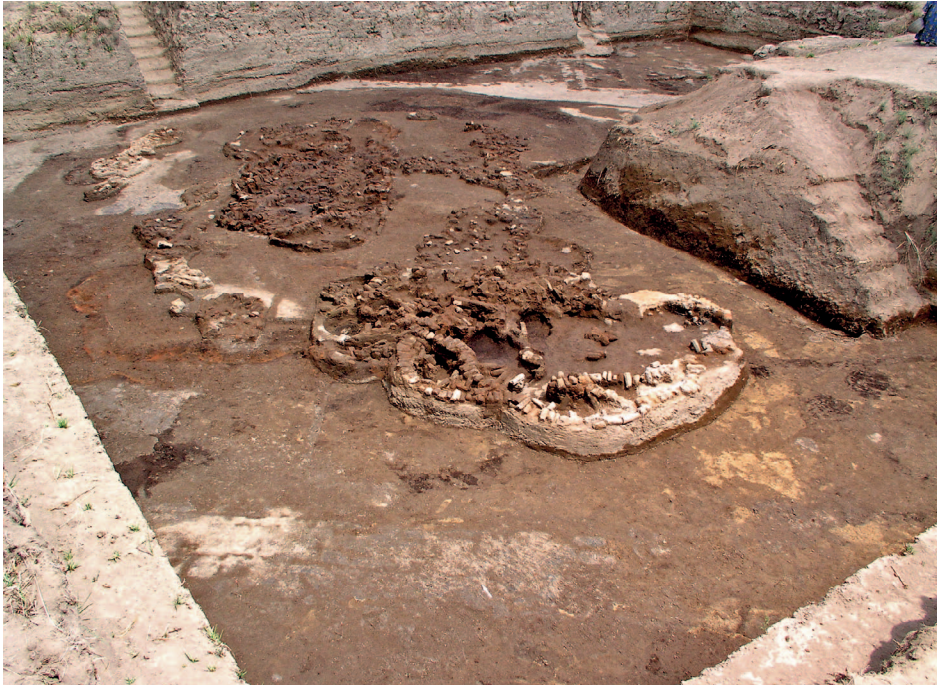
7. Mud brick walls surrounding the brewery at the Western Kom. View from the South

mention that outside this “residence” any valuable items, dated on the Lower Egyptian culture, were found.