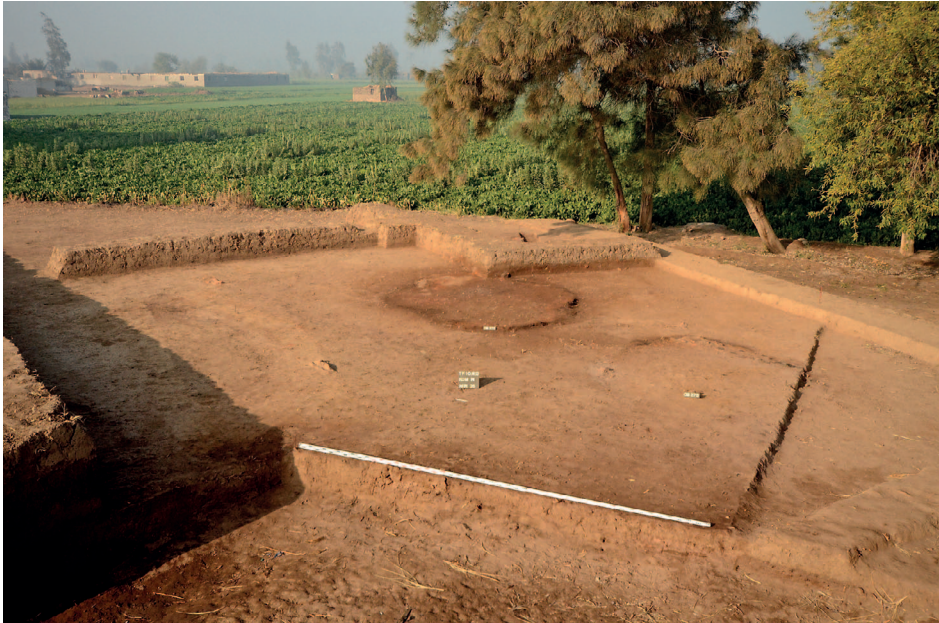
10. Youngest brewery from Western Kom. On top of it walls of administrative-cultic centre. View from the East.

provided with beer and the organization of work, at least in the Delta, had to be in those times on a very high level.