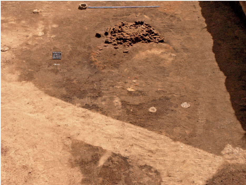
9. Fragments of brewery from the Central Kom and wall separating the Lower Egyptian “residence”. View from the West.

was rebuilt. East of it, in a place formerly occupied by houses, a small brewery, similar to those from the Western Kom, was erected (Fig. 9). At the beginning a hypothesis arose that the beer from both mentioned breweries was used by the inhabitants of the Lower Egyptian “residence” and Naqadian building.