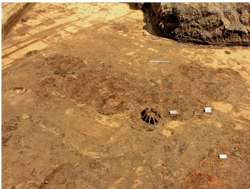
6. Remains of the oldest brewery form Western Kom. In upper left corner traces of wooden fences. View from the West