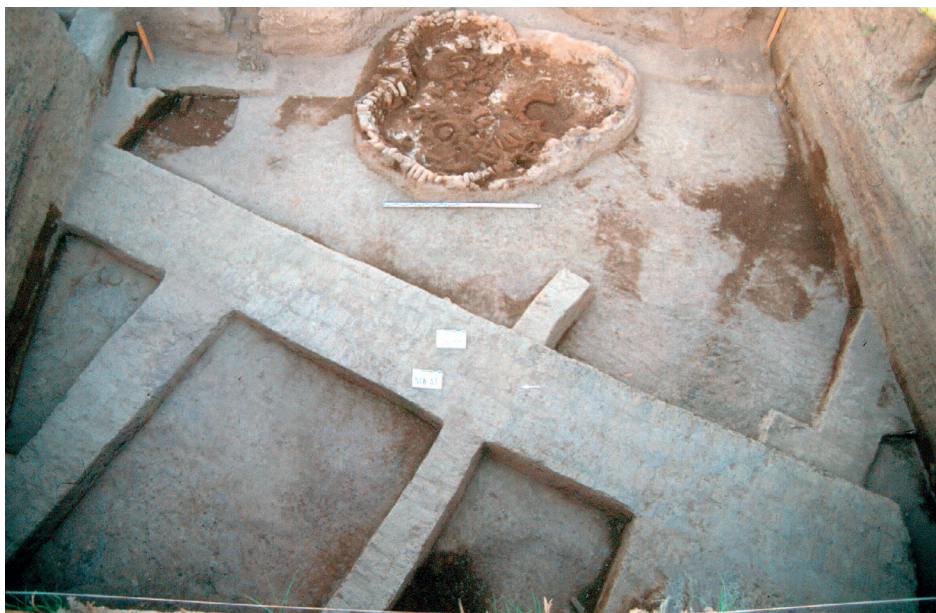
8. Fragment of Naqadian building and brewery dated on Naqada IID2. View from the West

Egypt and the South and Near East are confirmed by tokens found in the Lower Egyptian layers. The beer produced at the Western Kom at a large scale was one of the most important goods exchanged for raw materials and products from the South and North-East. To sum up, we can suppose that the base of commercial relations between Egypt and the Near East was established by the Lower Egyptians. In the end, Naqadian settlers at Tell el-Farkha had a clear way and could rise the relation on the higher level.