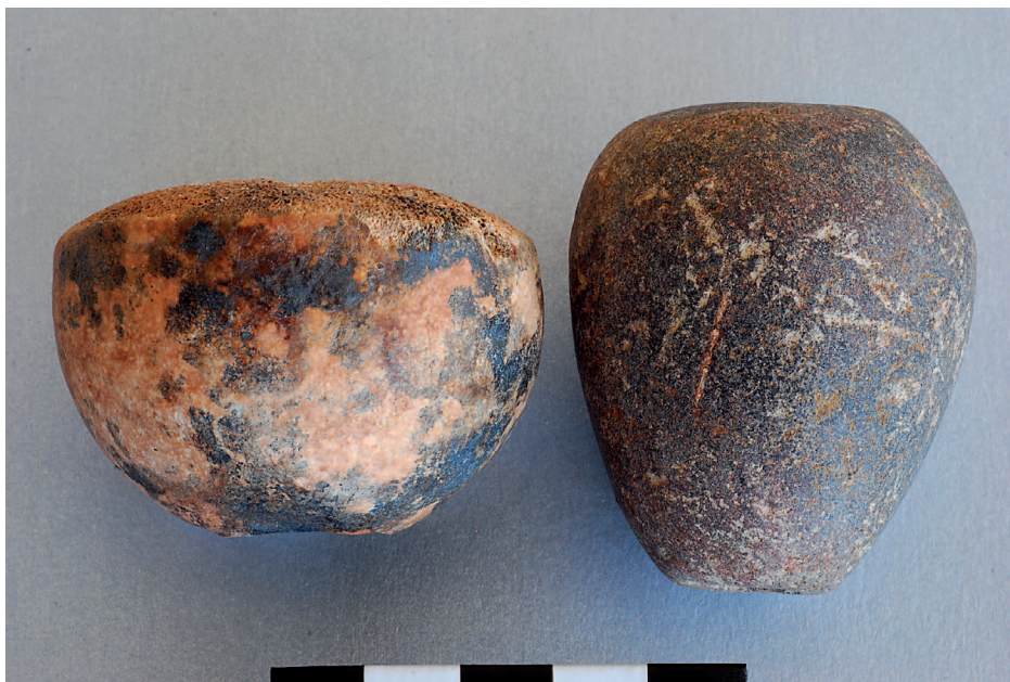
4. Mace-heads from the Central Kom

relations with the Levant were evident (Seeher 1990: 151). Much more important are proofs for significantly closer connections with Upper Egypt, visible not only in quite numerous potsherds but also in flint tools, cosmetic palettes or stone vessels. Among them are also two mace-heads, which were found in the northwestern part of the residence (Fig. 4). The first one, made of basalt, bears traces of impacts on its surface. The second, made of bone, must have been purely of symbolic character. These mace-heads are the oldest items of this kind found in Tell el-Farkha, and, moreover, the bone object belongs to very rare finding.