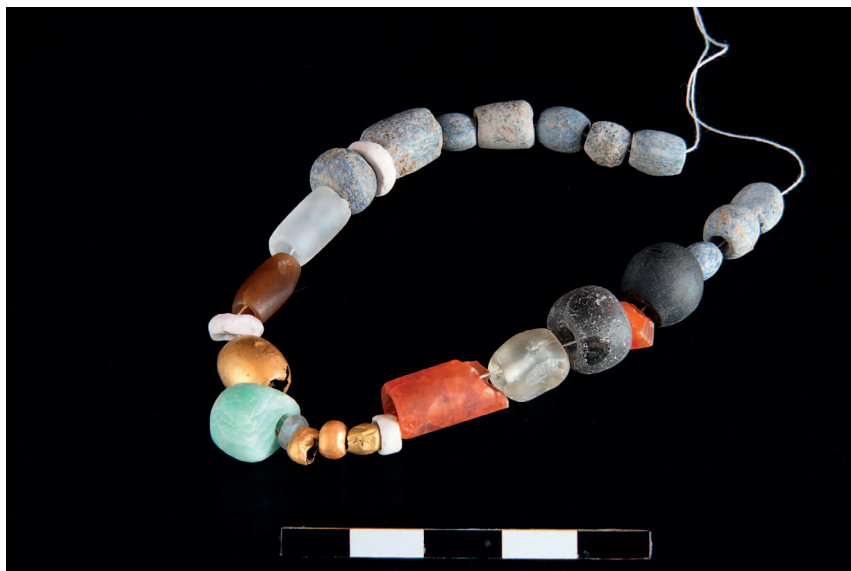
5. Stone and gold beads from the Central Kom