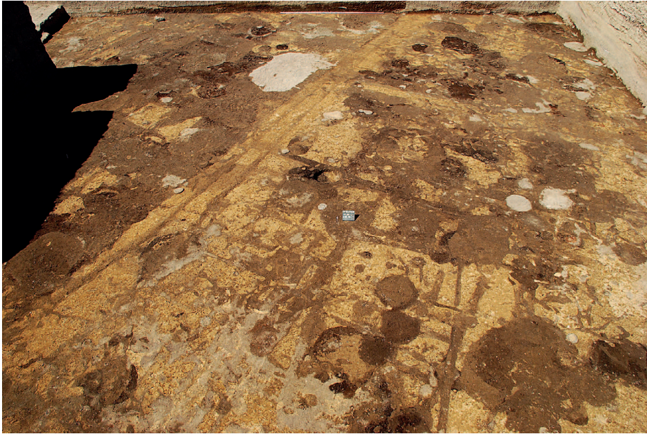
2. Remains of Lower Egyptian houses. View from the South

cases it was possible to ascertain that timber beams were half round, placed flat side up. The width of the beams was usually not larger than 20 cm, although a number of them was 30 cm wide. The beams run parallel or perpendicular to each other and spaces between them were small. It seems that not all of the furrows correspond to partition walls of individual rooms – it is difficult to ascertain the size and amount of the separate rooms. This complicated structure had different construction than other simple single small houses found on the site and most probably we have recorded only structures lying under the floor of that large building.