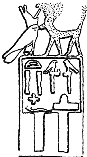
The royal name of king Khasekhemui, 2nd dynasty (after: Capart J., Memphis à l'ombre des pyramides , Bruxelles 1930, fig. 116)

(after: Dreyer G., Kaiser W., Umm el-Qaab. Nachuntersuchungen im frühzeitlichen Königsfriedhof. 2. Vorbericht, MDAIK 38: 211-269, 1982)