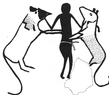
Separation of fighting lions - the balance of power is maintained. Scenes from the Hierakonpolis painting and from the Gebel Arak knife (after: Quibell J.E., Green F.W., Hierakonpolis II , London 1902, pl. XXVIII; Mellink M.J., Filip J., Ancient Egypt , Berlin 1917, fig. 4)