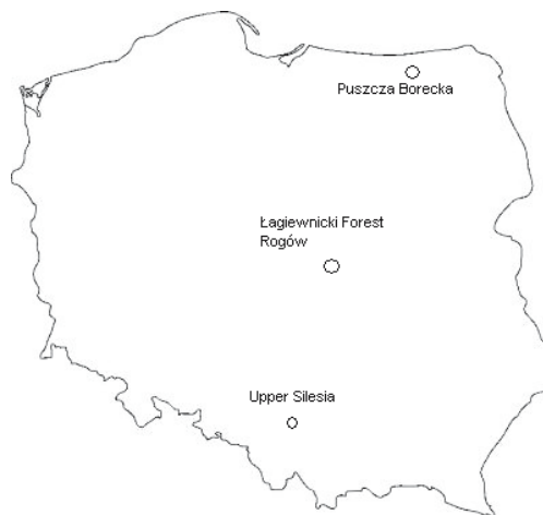
Fig. 1. Location of the study sites

The material for analyses comprising soil and plant samples was collected from 21 points in various regions of Poland, within three sample sites: Puszcza Borecka, Rogów and Łagiewnicki forests and forest soils located in the Upper Silesia area (Figure 1). In the Borki forest division (Puszcza Borecka) fresh habitats dominated (66.5% of total area) and the least was marsh (17.7%) and humid (15.7%) habitats. In the forest stand spruce (28.1%) and pine (23.9%) species dominated. In this forest division there is the largest amount of four or more species. Diversity of forest age is not large. Mostly trees are in the age from 41 to 50 years. Deciduous and semi-deciduous forest with oak, hornbeam, maple