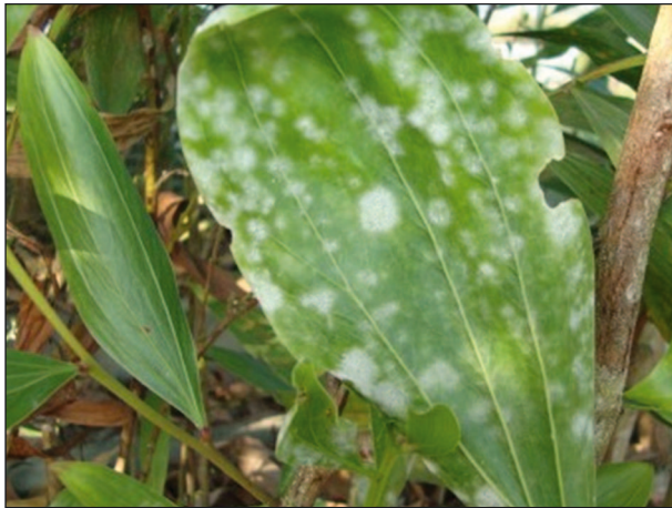
Fig. 1. Powdery mildew symptoms on A. mangium leaves

The disease was not severe in the studied area but leaflets were affected to a great extent in shade house conditions. As a result of infection, the surface of leaflets and phyllodes were completely covered with spores and mycelium which might affect physiological functions such as photosynthesis and transpiration leading to slow