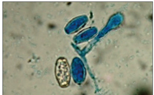
Fig. 4. Conidiophores and conidia