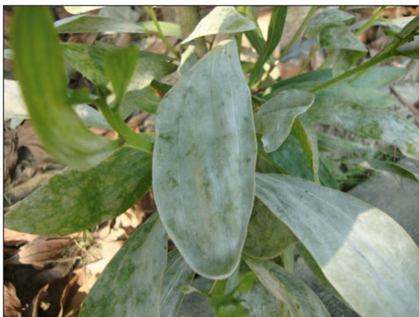
Fig. 2. Powdery mildew symptoms on A. mangium leaves