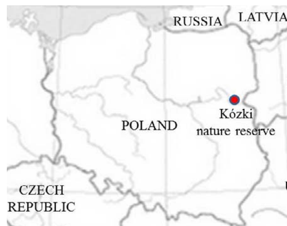
Fig. 1. Localization of the Kózki Nature Reserve

The investigations were conducted in the years 2010–2013 in the Kózki Nature Reserve (52°21' 42.54" N 22°51'39.61" E), covering an area of 82.1 ha and located in the northern part of the Sarnaki municipality (Mazowieckie Province), in the “Podlaski Przełom Bugu” Landscape Park (Fig. 1). The name “Kózki” originates from the same-named village bordering the reserve. The studies were concentrated on the southern part of the grasslands separated from the northern part by an old riverbed of the Bug River. The area of about 15 ha, which belongs to an individual farmer, is a ground for sheep of the native Świniarka continuously grazed as part of package 7 of the agri-environmental scheme “Preservation of endangered genetic animal resources in agriculture”. Stocking density in particular years was 90–110 sheep in 2010, 110–157 in 2011, 110–120 in 2012 and 120 sheep in 2013.