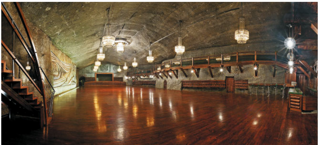
Photo 1. The Warszawa Chamber, view towards the West

In order to preserve the historic excavations of the Wieliczka Salt Mine, it is necessary to protect them against natural hazards occurring in the mine, which include water, collapse and gas hazards. A large number of mine excavations is located in the conservation protection zone and listed in the national register of monuments and the UNESCO List, the long experience in