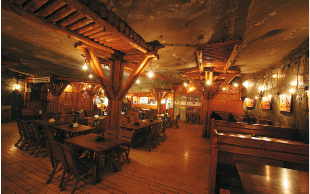
Photo 2. The Budryk Chamber, view towards South-West