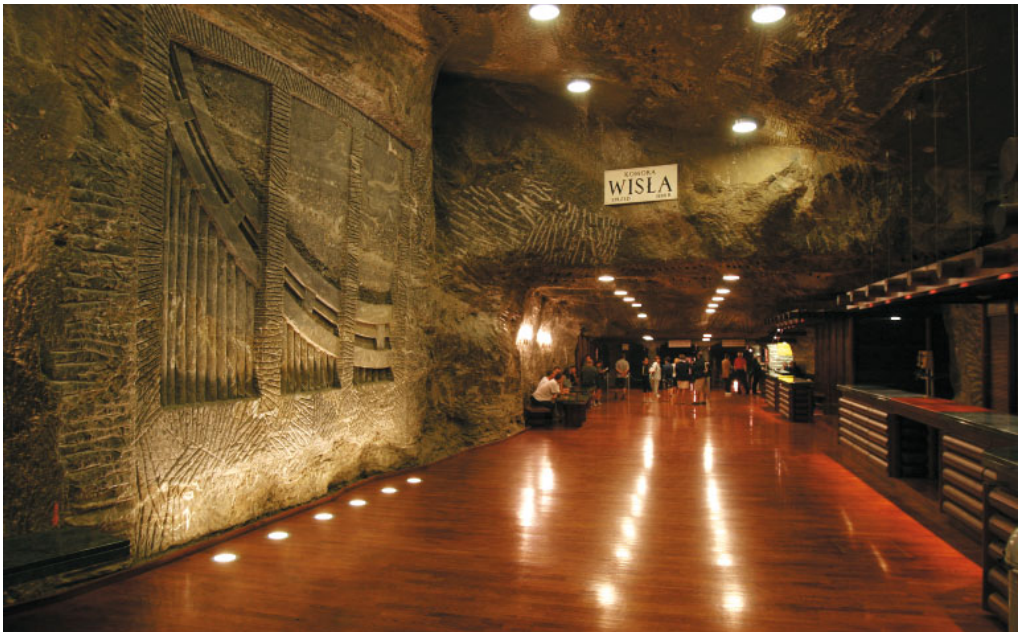
Photo 3. The Wisla Chamber, view towards the West